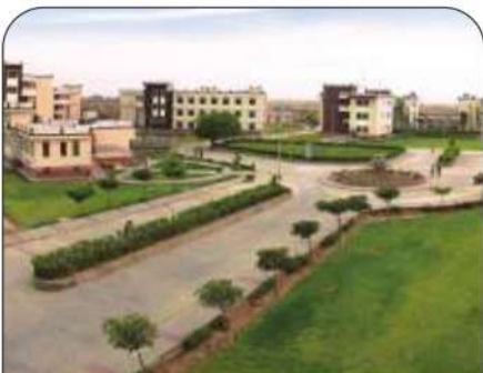
Jagannath University Village Rampura, Tehsil Chakshu, Jaipur (Rajasthan)