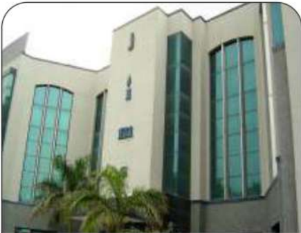
Jagannath International Management OCF, Pocket-9, Sector-B, Vasant Kunj, New Delhi