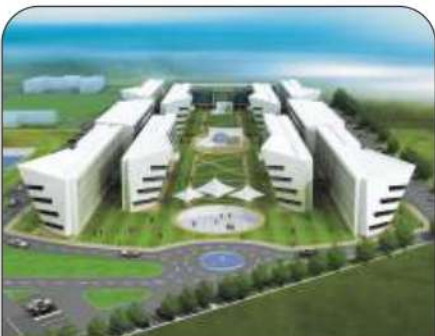
Jagannath University BahadurGarh (Haryana)