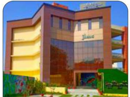
Jagannath Institute of Management Sciences 3, Institutional Area, Phase-II, Vasant Kunj, New Delhi-70