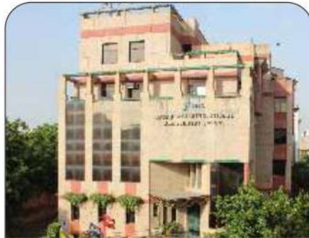
Jagannath International Management School MOR, Pocket 105, Kalkaji, New Delhi