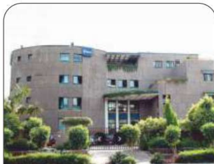
Jagannath Institute of Management Sciences 3, Institutional Area, Sector 5, Rohini, New Delhi